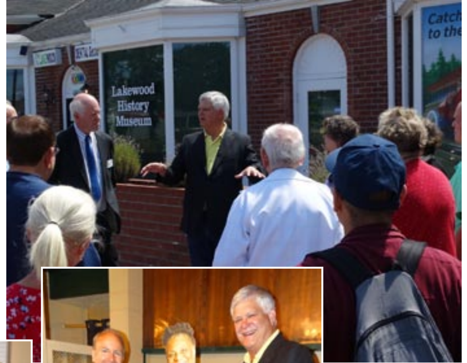
Above: The mayor addresses visitors outside the museum, then...