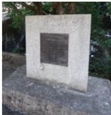
Among a few historical markers predating those erected by your Society is this one, standing in the parking lot of the Lakewood Veterinarian Hospital:

*Sometime between the end of the Byrd Mill's operations in the 1890s and the construction of the furniture factory, the site (according to Tacoma Public Library archives) is believed to have been occupied by the Coops Piano Company --a somewhat surprising enterprise to encounter in the near-wilderness of early 20th Century Pierce County and about which nothing else seems to be known.