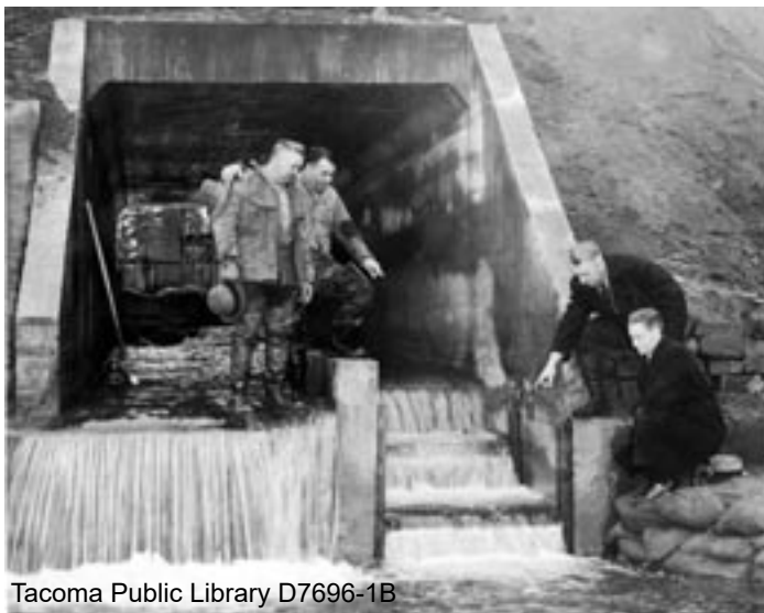
Tacoma Public Library D7696-1B

On December 6, 1938 the men responsible for solving the salmon run problem gathered around the concrete tunnel under Steilacoom Boulevard to have their photo taken with the just-completed fish ladder they had designed and constructed: