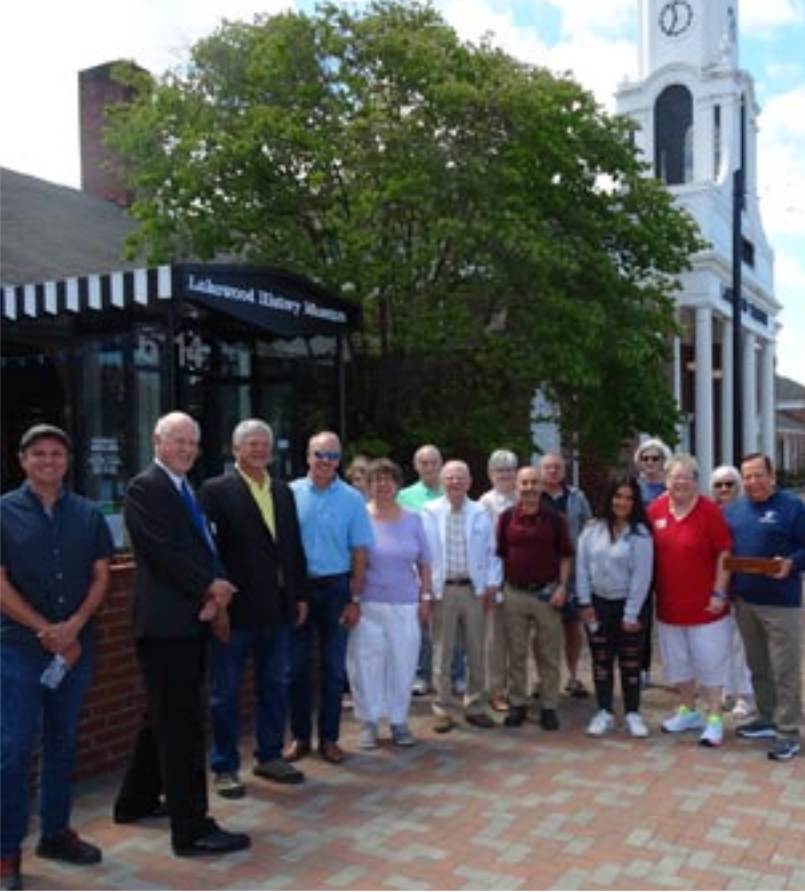
Left: Dignitaries, LHS officers and visitors pose for a group shot--with the stately tower of the old Lakewood Theatre looming behind them.

2021: Renovations wrap up just as our state is emerging from the last of its pandemic-induced restrictions. Time to welcome visitors back. Word goes out and a grand reopening party is held on July 17.